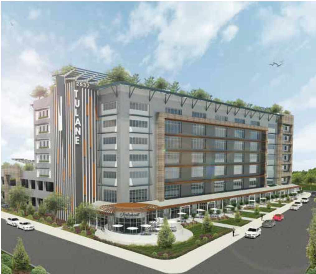
Proposed Residential Development - Extended Stay Hotel, Multi-Family, Student Housing, Senior Housing