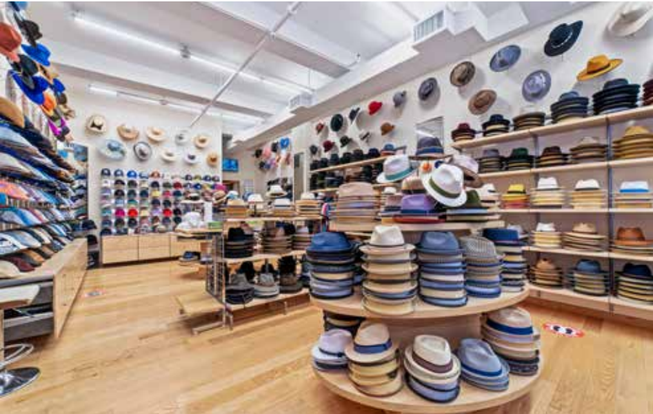
Madison Avenue Storefront | 755 SF