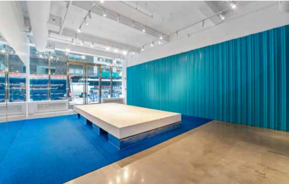
Madison Avenue Storefront | 968 SF