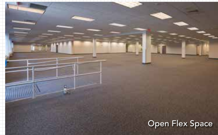
Open Flex Space